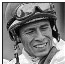
Eclipse winner Edgar Prado rode Round Pond to victory in the Distaff.

Tight Spot (M, 9th-dh, 1991) Triptych (T, 4th, 1988) Trumpet's Blare (JF, 6th, 1989) Tsunami Slew (M, 5th, 1985) Wall Street Dancer (J, 9th, 1990) Zabaleta (S, 4th, 1987)