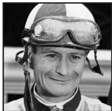
First-time Breeders' Cup winner Calvin Borel rode Street Sense.