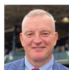
Tom Rooney, NTRA President and CEO and former U.S. Congressman

NTRA fields a government relations team based in Washington, DC, that is led by former U.S. Congressman and current NTRA President and Chief Executive Officer, Tom Rooney. NTRA also coordinates with the American Horse Council on legislative advocacy issues that affect all equine breeds and disciplines.