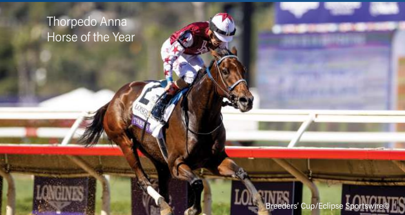
Thorpedo Anna Horse of the Year