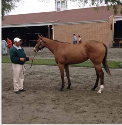
Barrett's March Select Sale of 2-Year-Olds in Training