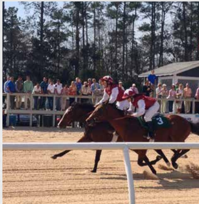
The Aiken Trials