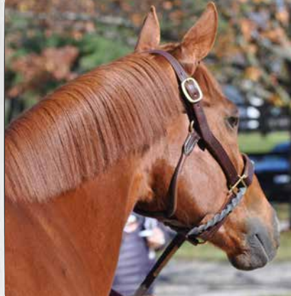
Fasig-Tipton The November Sale