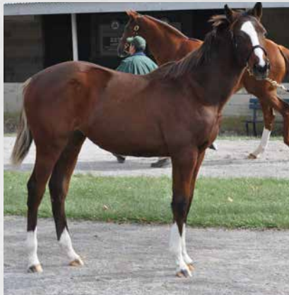
Keeneland November Breeding Stock