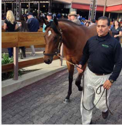
Barretts March Select Sale of 2-Year-Olds in Training