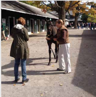
Fasig-Tipton The Saratoga Fall Sale