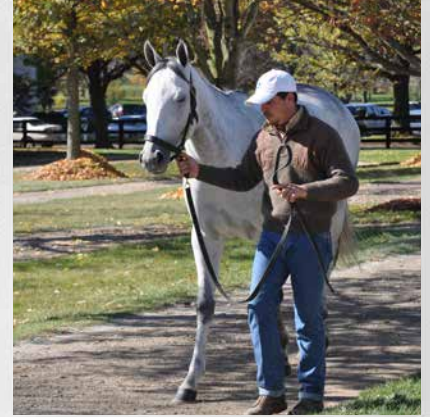
Fasig-Tipton The November Sale