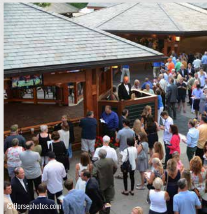
Fasig-Tipton Saratoga Selected Yearlings