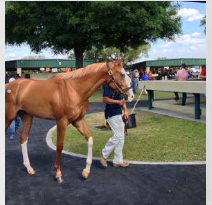
OBS Spring Sale of 2-Year-Olds in Training