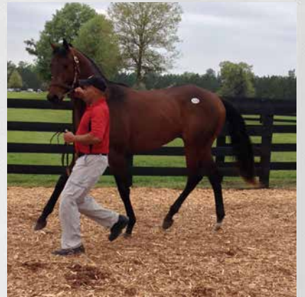
Fasig-Tipton The Florida Sale