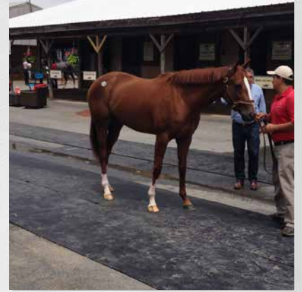
Fasig-Tipton Midlantic 2-Year-Olds in Training