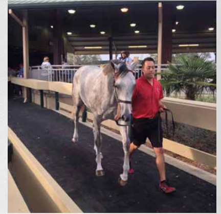
DBS March Sale of Selected 2-Year-Olds in Training