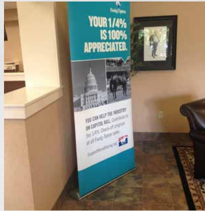
Fasig-Tipton The July Sale