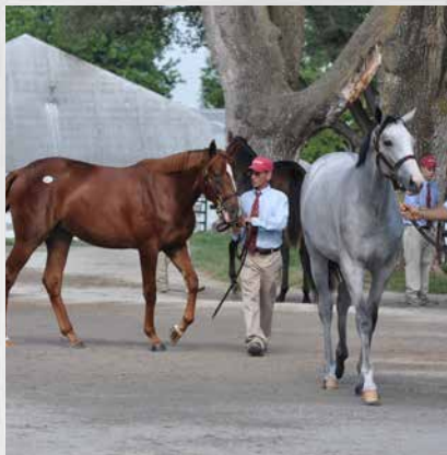
Keeneland September Yearling