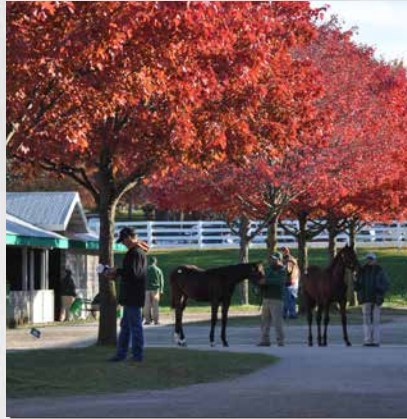
Keeneland November Breeding Stock