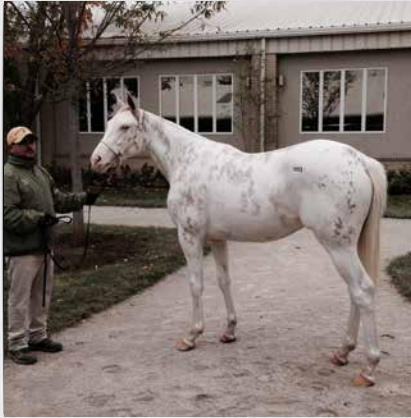
Fasig-Tipton Kentucky Fall Yearlings