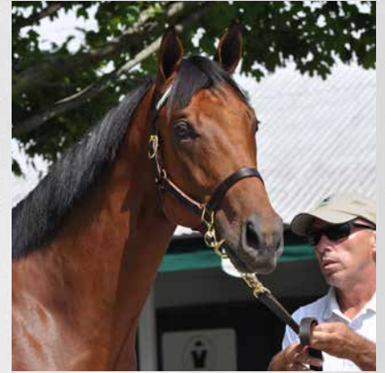
Keeneland September Yearling