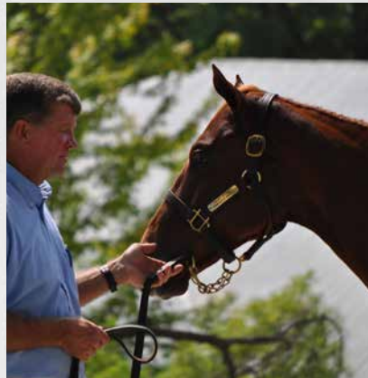
Keeneland September Yearling